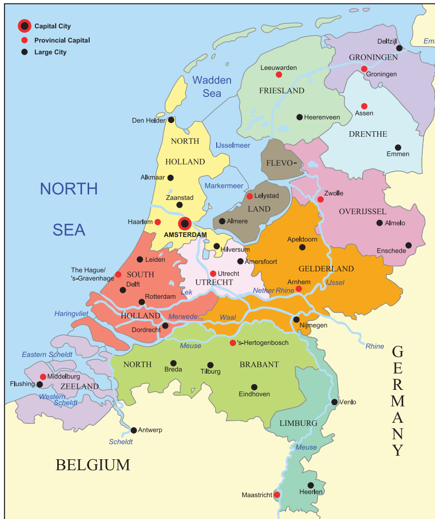
Figure 1 The 12 provinces of the Netherlands, the 12th province (Flevoland) is a recent province (land reclaimed from water) and was not included as a separate sampling unit.

equal representation from the original 11 Dutch provinces (see Table 1), oversampling the two major cities Amsterdam and Rotterdam. The 12th province, which was established in 1986, was not included, as it was populated by recent immigration from surrounding areas.